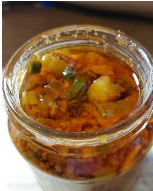
Figure 6. Packaging opened on day 6

The first step in large-scale processing is conducting food lab tests. Lab tests are conducted to assess the shelf life of grilled chili sauce products, their content, color, and consistency after testing. The lab tests resulted in the conclusion that opening the glass jar packaging after 6 days, 2 weeks, and 3 weeks still produced the same results as the initial production.