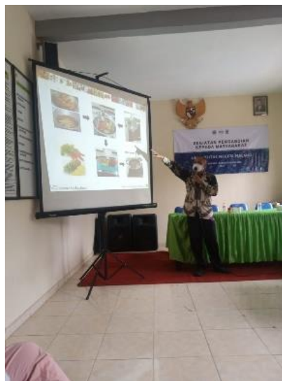
Figure 3: Speaker Explains Food Packaging Processing Activities Contoh Tabel:

This activity began with a theoretical presentation from an expert in food preservation. The topics covered included food canning, with a sub-topic on the procedures of food canning and canned food spoilage