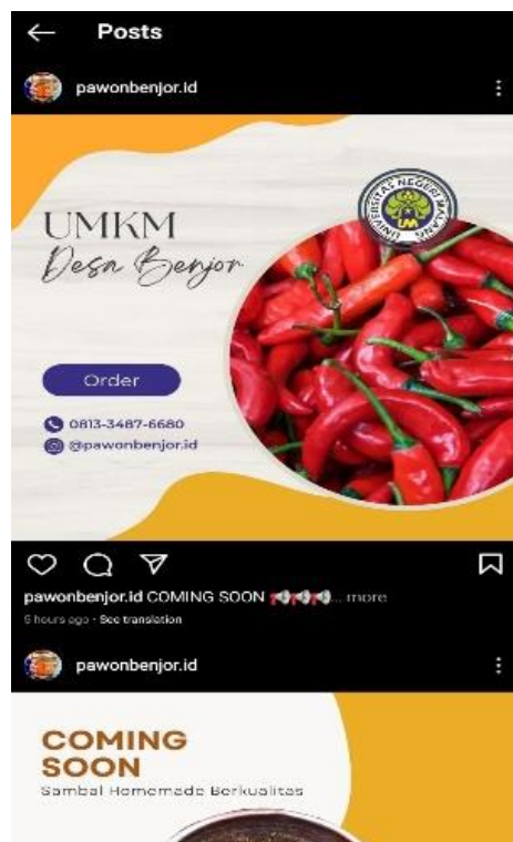
Figure 10. Utilization of Instagram Social Media

Social media serves as a promotional platform utilized by many to attract consumer attention. Such promotion is imperative for business owners. In the form of promotion found on the social media account of Pawon Benjor's Special Grilled Chili Sauce, persuasive messages are effectively employed with the aim of capturing consumer interest. The social media account widely accessible for grilled chili sauce products is the Instagram account named @pawonbenjor.id. According to 16 , an Instagram social media account not only offers entertainment but also holds potential for facilitating entrepreneurial activities in society. Direct marketing activities carried out on Instagram @pawonbenjor.id include providing contact numbers, directional instructions in the Instagram profile details, and a section showcasing new products referred to as "unboxing time."