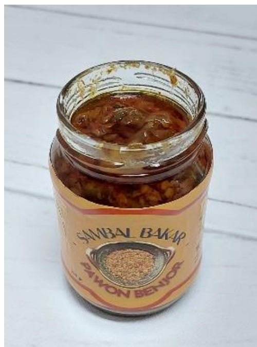
Figure 7. Packaging opened after 21 days