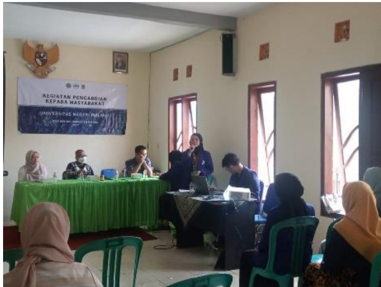
Figure 2. PkM Activity Opening

The PKK (Family Welfare Movement) team in Benjor Village, through a series of activities led by the PkM (Community Service Program) activity implementation team, received comprehensive education on proper food packaging procedures to produce the distinctive Grilled Chili Sauce of Pawon Benjor.