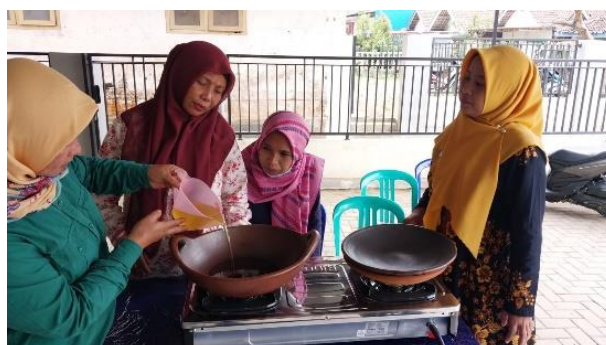
Figure 5. Preparation for Grilling Chili Sauce in Clay Containers

The distinctive Pawon Benjor grilled chili sauce began as a product made solely on demand. Gradually, grilled chili sauce expanded to its immediate surroundings. Over time, the production of grilled chili sauce became more frequent, necessitating more prominent branding concepts for wider marketing. The processing of food packaged in glass jars requires several stages to ensure the product does not spoil quickly.