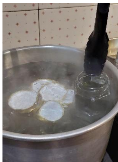
Figure 5. Preparation of Glass Jar Containers and Washing and Sterilization Before Filling

The second procedure is container preparation. The containers for Grilled Chili Sauce are glass jars. What needs to be considered at this stage is the inspection of the glass and boiling water washing for 15 minutes.