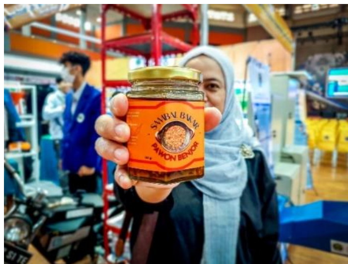
Figure 9. Packaging/Label of Pawon Benjor's Special Grilled Chili Sauce

Food labeling, in general, means providing information on food packaging, labels, or collective packaging related to packaged food 15 . This information is included in the label stickers of Pawon Benjor's signature grilled sambal packaging and can consist of words, letters, logos, images, numbers, or symbols, referring to the product's shelf life, preparation, consumption, nutritional value, or other commercial aspects. Moreover, the labeling for Pawon Benjor's signature grilled sambal product fulfills a promotional function, as its appearance and content can motivate buyers to purchase the product at specific sales locations.