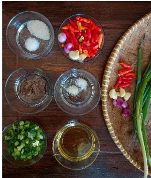
Figure 4. Ingredients for Making Grilled Chili Sauce

The canning of food involves several procedures. First is the preparation of raw materials. The raw materials for Grilled Chili Sauce products fall into the fruit and vegetable category, which require washing, peeling, cutting, skin removal (shelling), and color preservation. The first procedure is further extended with blanching, which is heating with steam or hot water directly at a temperature of 82-93°C for 3-5 minutes. The purpose of this heating is to shrink the volume of the material, facilitate packaging into containers, reduce gas from tissues, clean the material, deactivate enzymes, and eliminate slimy substances (especially in legumes).