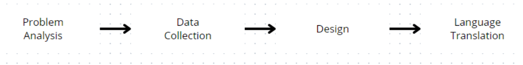
Figure 1. Method of Creating MSME Catalog

both the quantity and quality of its exports. The stages of the Fancy Copper catalog creation method are presented in Figure 1: problem analysis, data collection, design, and language translation.