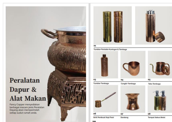
Figure 8. Kitchen Utensils and Tableware Products

Kitchen utensils made of copper or brass are crafted from these metals due to their excellence in heat conductivity, resistance to corrosion, and an elegant aesthetic appearance. Utensils such as pots, pans, woks, and cutting tools can be made from copper or brass. However, special care is required to maintain the shine and prevent natural color changes in these utensils over time. Examples of products in the catalog include tumblers, steamers, cups, teapots, and soap dishes.