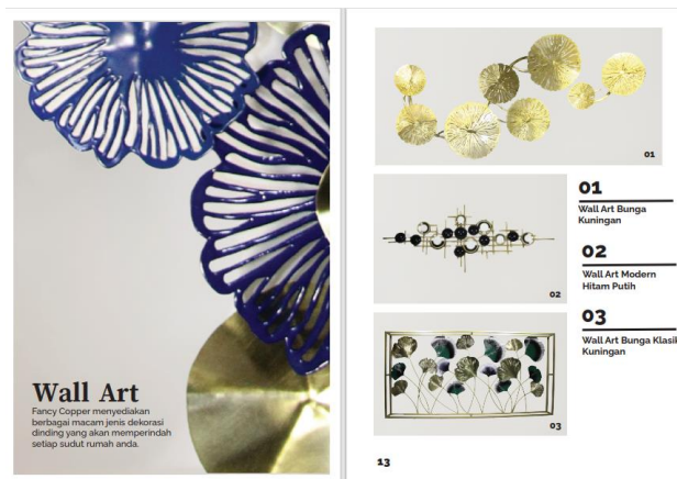
Figure 6. Wall Art Products

Wall art is a form of art or decoration installed on indoor walls to beautify, express style, and create an atmosphere that aligns with the room's theme. It encompasses various types of artwork such as paintings, prints, photography, and textile-based wall decorations. Wall art comes in various sizes, styles, and themes, allowing it to be customized to the aesthetic preferences of the room's occupants. Some examples of wall art available in the catalog include brass flower wall art, modern black wall art, and classic brass flower wall art.