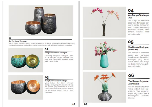
Figure 7. Pot & Flower Vase Products

designs to meet diverse decorative preferences. Examples of products in the catalog include decorative bowls made of copper or brass, as well as flower vases made of copper, brass, or aluminum.