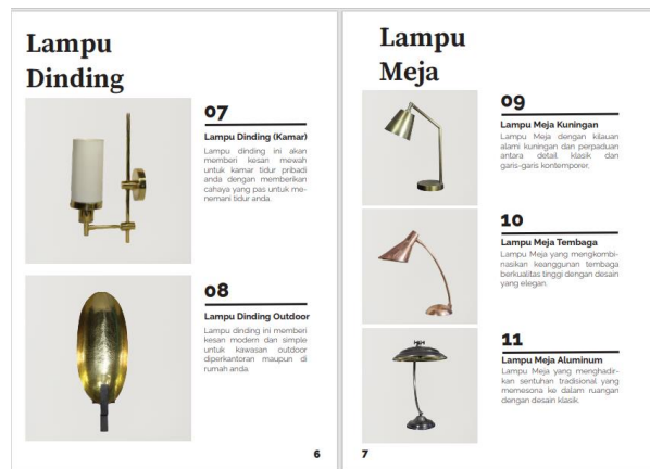
Figure 3. Wall Lamp and Table Lamp Products