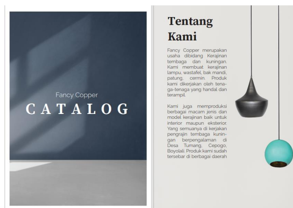
Figure 2. Cover Katalog Produk Fancy Copper

This product catalog serves as a comprehensive guide to exploring the unique copper and brass craftsmanship from Fancy Copper MSME. In this catalog, various high-quality products are featured, ranging from lamps, sculptures, mirrors, to highly popular bathtubs. Additionally, the catalog provides detailed information about each product, including the name, description, technical specifications, size, material, and high-quality product images.