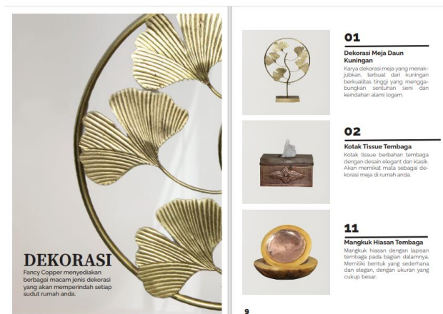
Figure 4. Decorative Products

Decoration refers to the practice or process of adorning or beautifying a space or object with various artistic elements, furniture, trinkets, or accessories. The goal is to enhance the aesthetics of the room or object, create a specific atmosphere, and reflect a particular style, taste, or theme. This can include: Table Decorations, Tissue Box Covers, and Bowls.